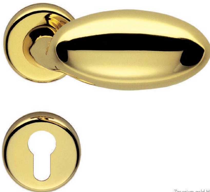
Zirconium gold HPS