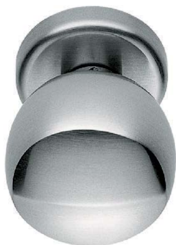
DAYTONA Cromat . Mat chrome