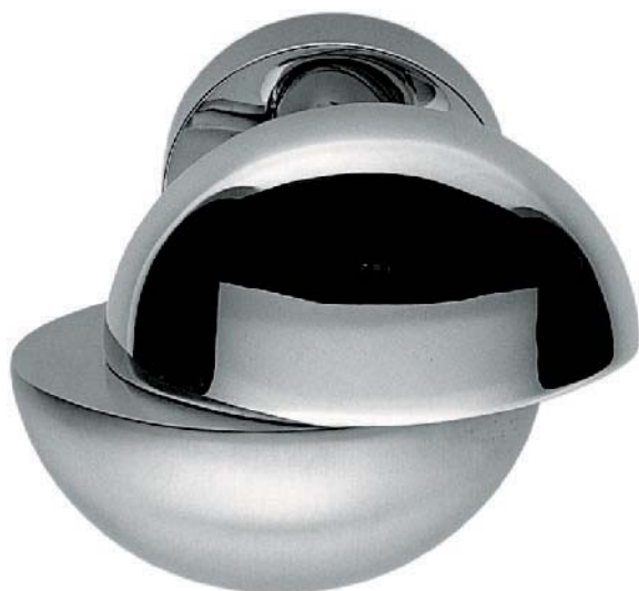
ETRO Cromo/Cromat . Chrome/Mat chrome