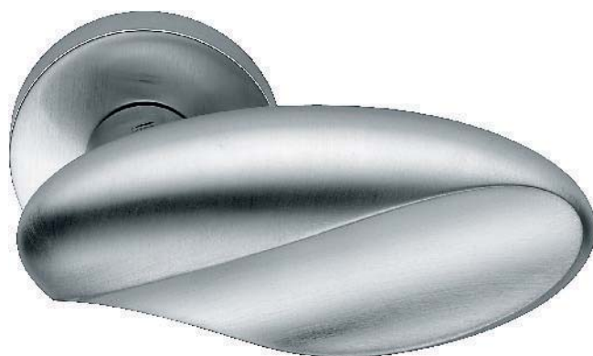
MOON Cromat . Mat chrome