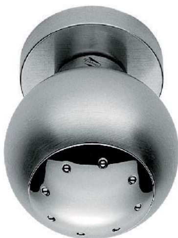
TANK Cromat/Cromo . Mat chrome/Chrome