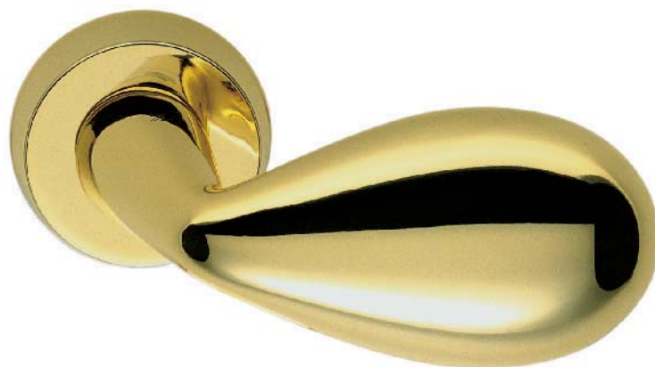
SECURA Zirconium gold HPS