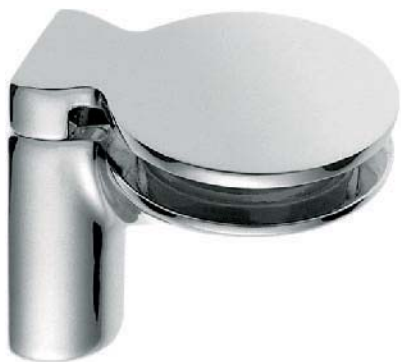
CB 114 Cromo . Chrome

Per cristallo e/o vetro. Spessore 6 ± 12mm.