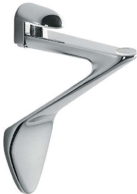
MH 114 Cromo . Chrome

For crystal or glass shelf. Thickness 6 ± 12mm.