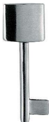
LC 14 Cromat . Mat chrome