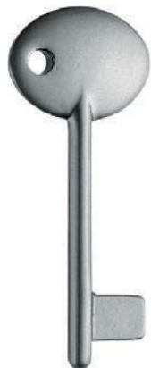
AM 14 Cromat . Mat chrome