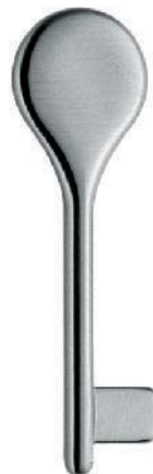
CB 24 Cromat . Mat chrome