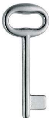
CD 14 Cromat . Mat chrome