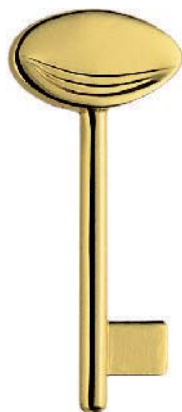
AR 14 Orolucido . Polished brass