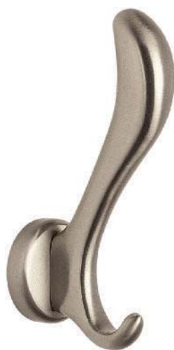
GOLF Nikelmat . Mat nickel