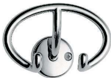
POLO Cromo . Chrome